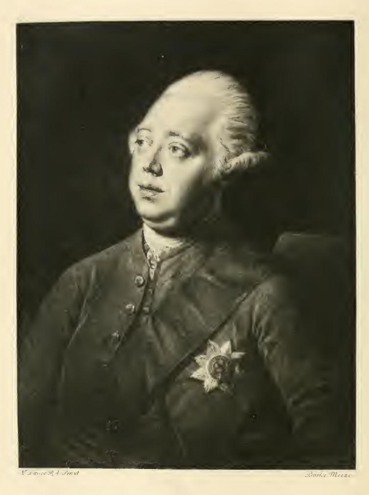
Lord o Forth.